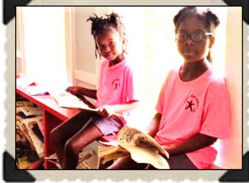
Learning While Reading At Summer Camp 2018