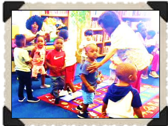
Boys And Girls Having Fun As They Learn During Summer Camp 2018

and such skills as sewing, art, and an entire leadership program.